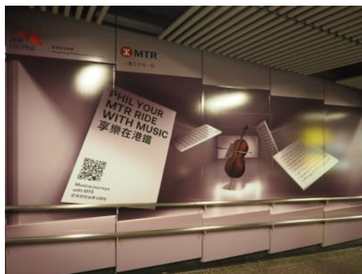
MTR Tsim Sha Tsui Station